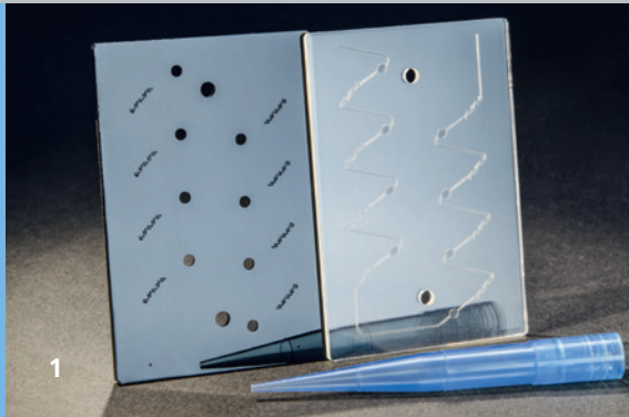
1 Chip for continuous \mu -titration